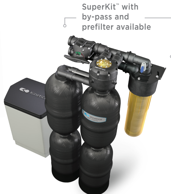
Model Shown: Q850

An unlimited supply of clean and healthy drinking water can be yours too.